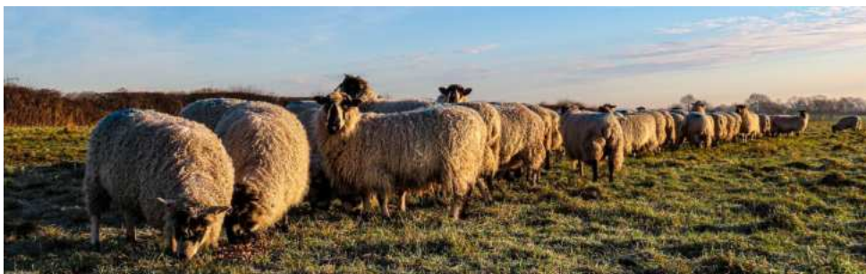
by Estelle Slegers Helsen of Waltham - see www.newtraces.uk .