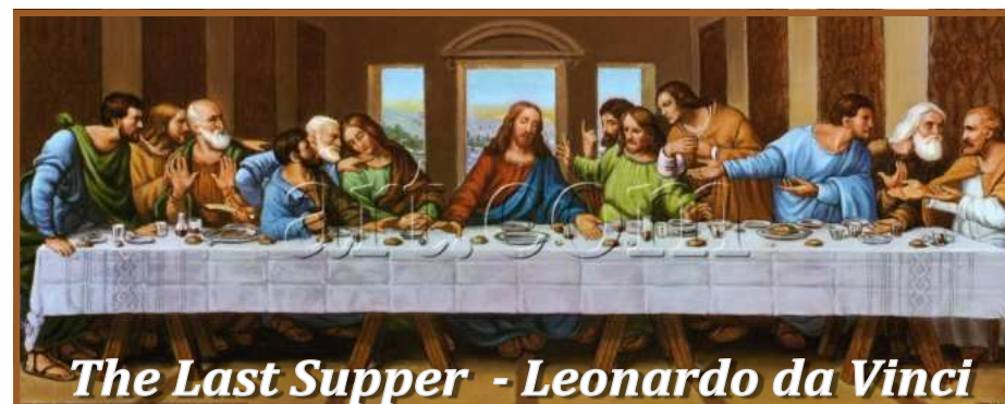
The Last Supper - Leonardo da Vinci

Commemorates the Eucharist (Holy Communion) instituted by Jesus at the Last Supper