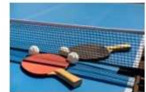
table tennis, games/crafts/activities.

We celebrated our 1 year anniversary in March with 27 young people!!